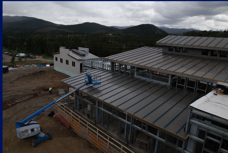
Town of Breckenridge Treatment Plant Project